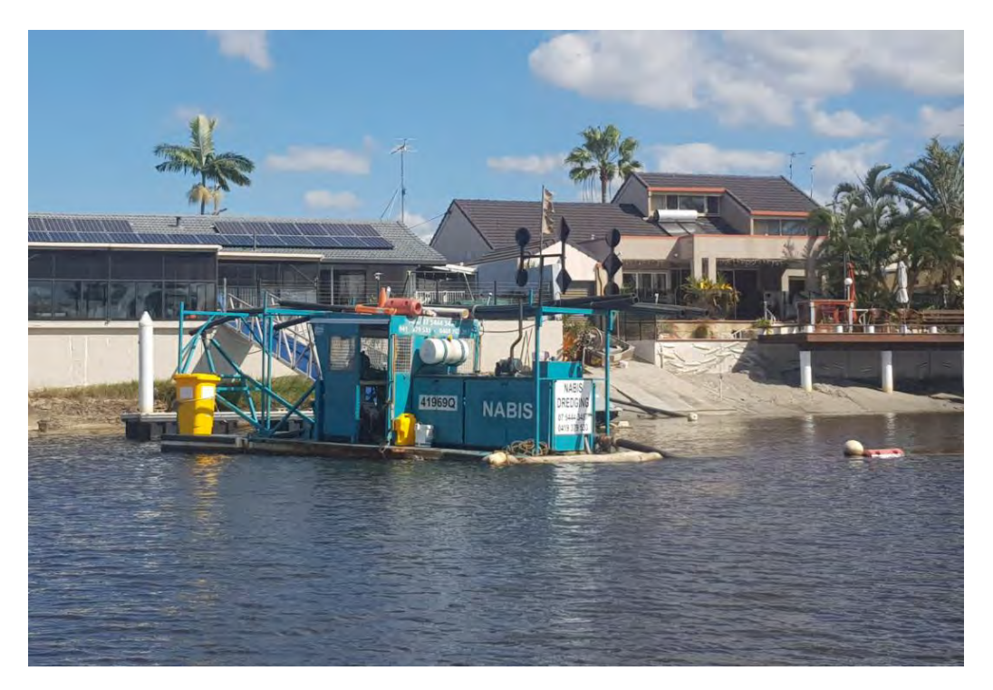
Figure 3-3 Dredging in progress to raise canal beach levels

The size of the dredges required for the canal profile maintenance is specified in Council's tender documents. These specifications have been developed based upon experience and with consideration of the requirement for the dredges to operate between and close to mooring structures.