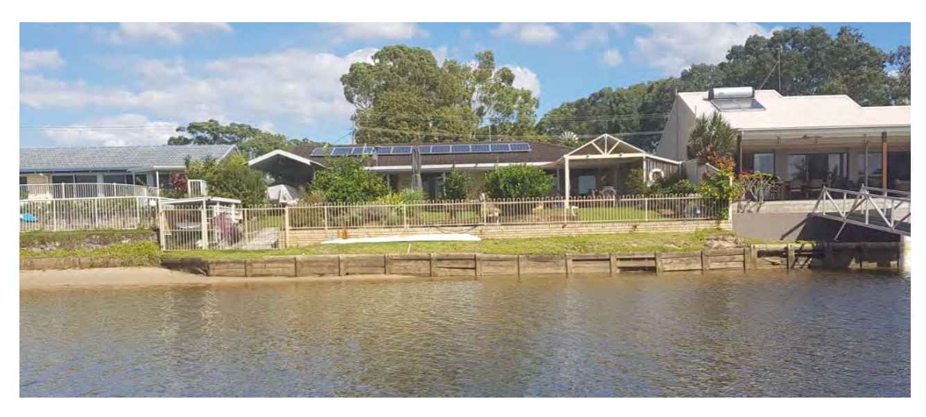
Figure 3-5 Grass stabilised canal beach with unapproved timber revetment wall

An example of a grass stabilised canal beach with an unapproved timber revetment wall is shown in Figure 3-5.