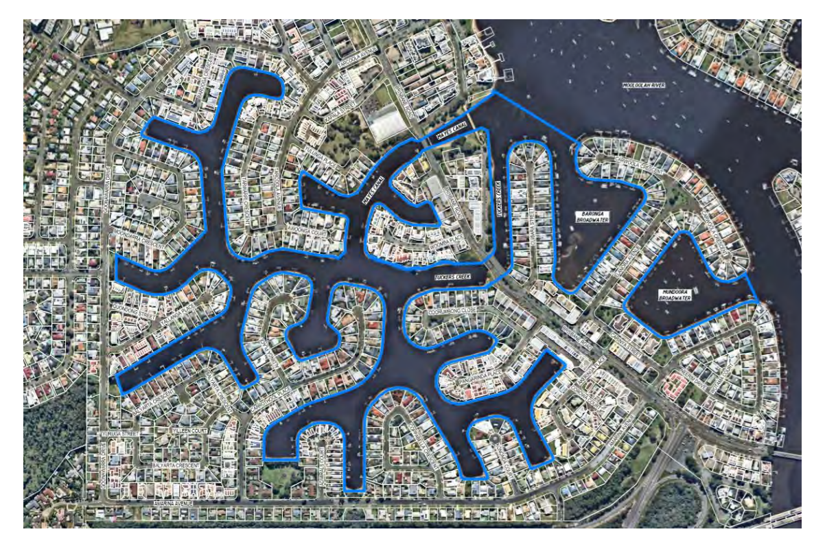
Figure 2-2 Mooloolaba Canal System