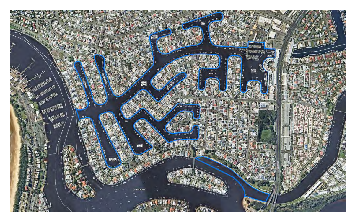
Figure 2-3 Minyama Canal System