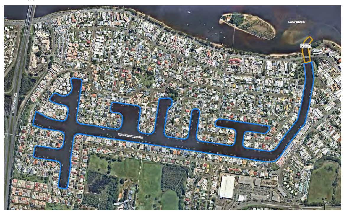
Figure 2-1 Maroochy Waters Canal System

These canal systems are shown on Figures 2-1 to 2-6. Copies of these figures in A3 format are also included in Appendix B.