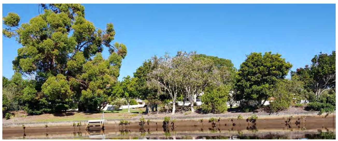
Figure 3-4 Mangroves colonising canal beach

In a number of canal systems, vegetation and, in particular, mangroves becomes established in the intertidal areas. This vegetation is removed by Council on a regular basis. A canal beach with colonising mangroves is shown in Figure 3-4