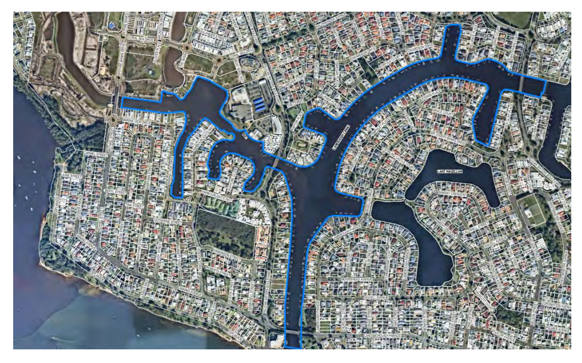
Figure 2-6 Pelican Waters Canal System