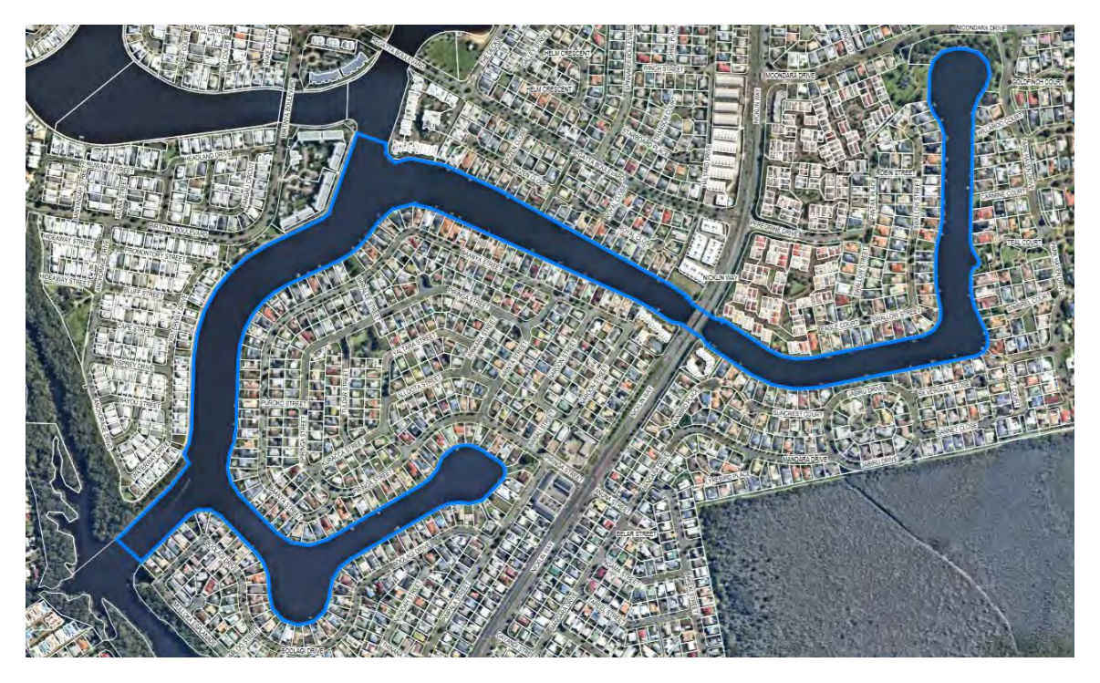
Figure 2-5 Wurtulla Canal System