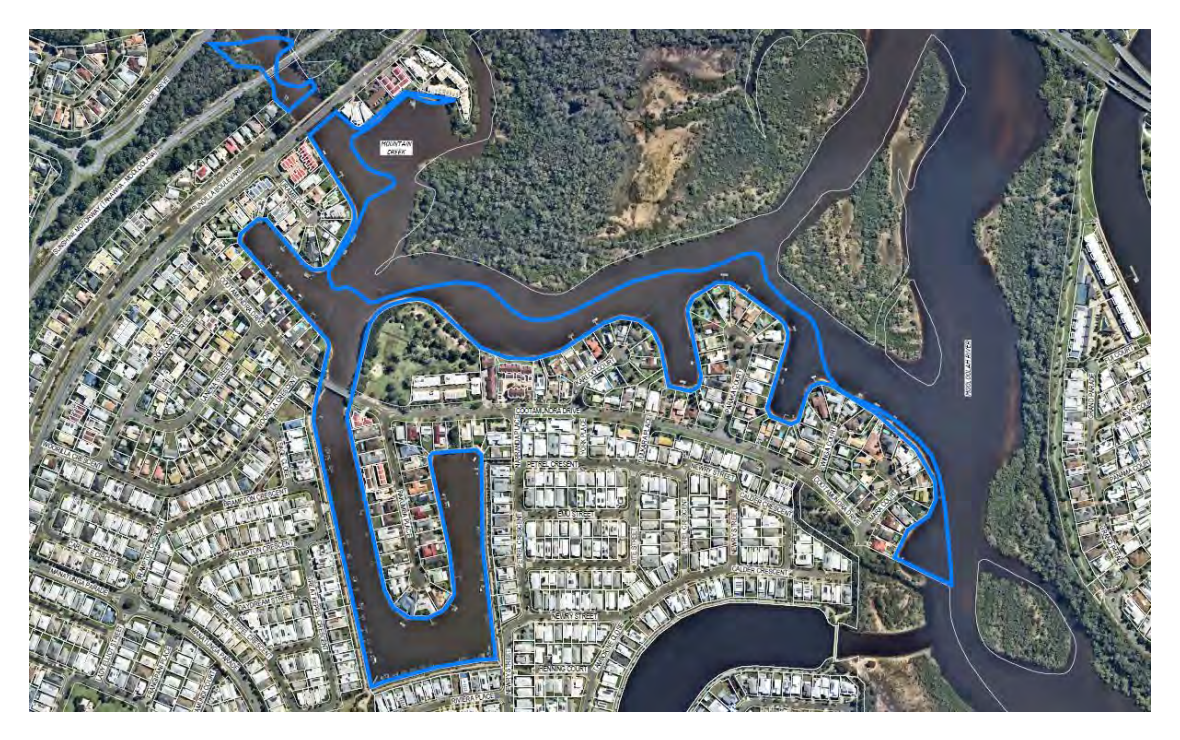
Figure 2-4 Hideaway Waters Canal System