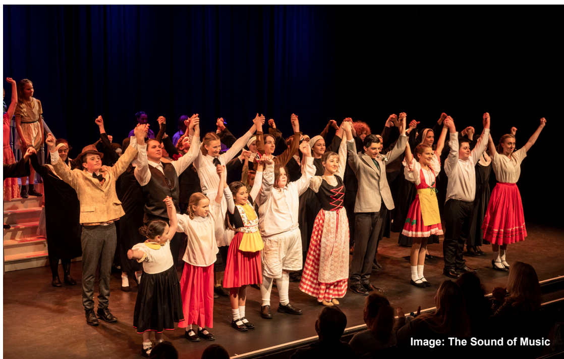
Image: The Sound of Music