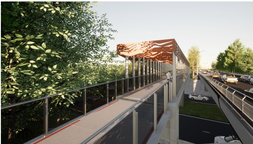
Figure 3: Decorative elements create patterns of light and shade as well as providing protection for users.