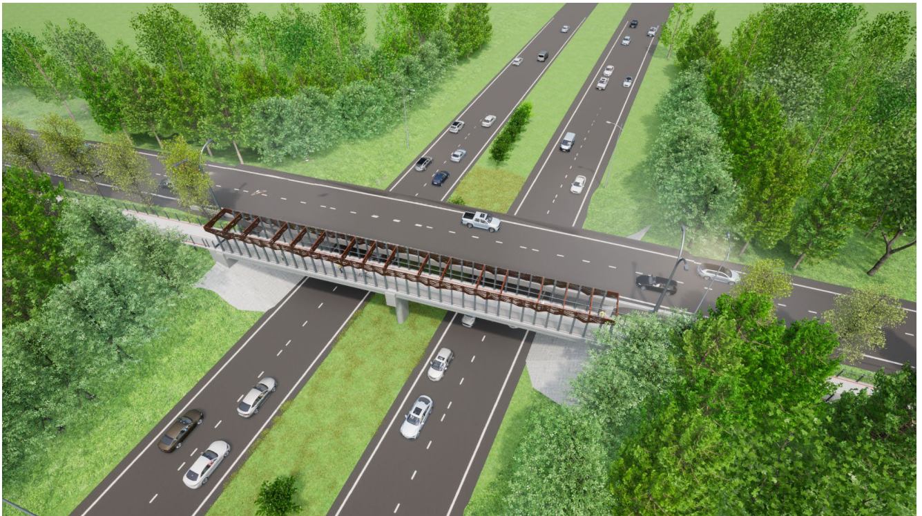
Figure 1: Artist impression (aerial view) of the new, stand-alone pedestrian and cyclist bridge to be constructed on the eastern side of the existing Stringybark Road bridge.

Locked Bag 72 Sunshine Coast Mail Centre Qld 4560