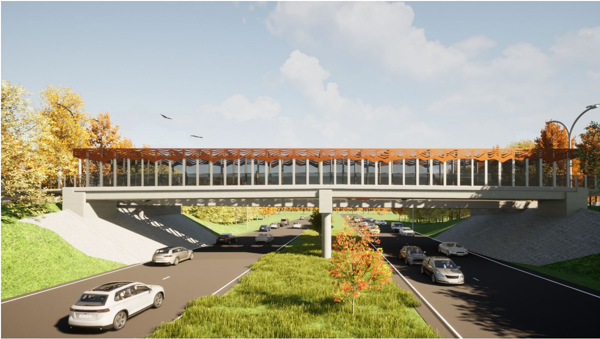
Figure 2: Artist impression of the new pedestrian and cyclist bridge when looking west, toward the existing Stringybark Road bridge.